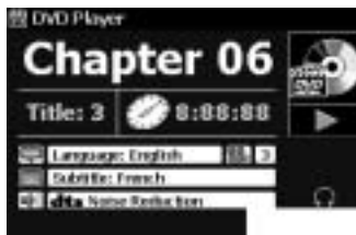
Large Screen Display