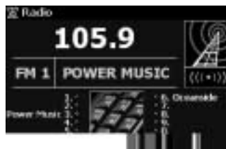
Large Screen Display