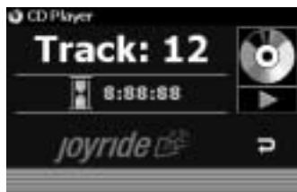
Large Screen Display